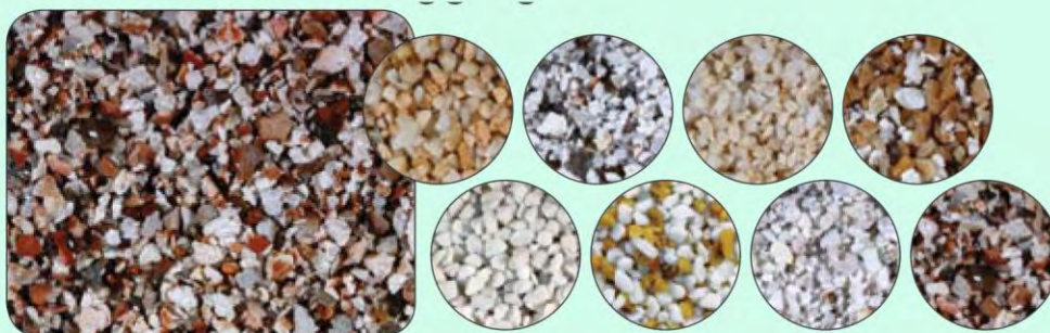
Dash Receiver and Aggregate