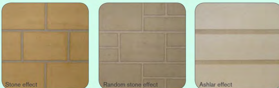
Stone & Ashlar Effect