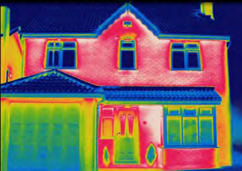
Heat Loss Before External Wall Insulation