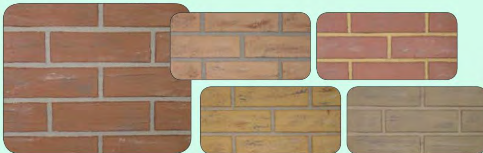
Multirend - Multistock Brick Effect