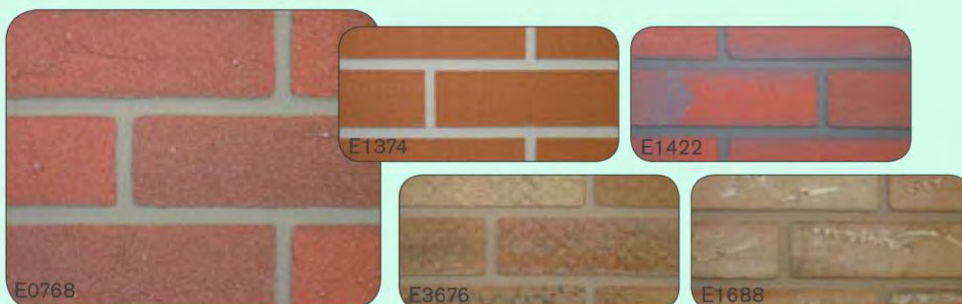
Acrylic Brick Slips